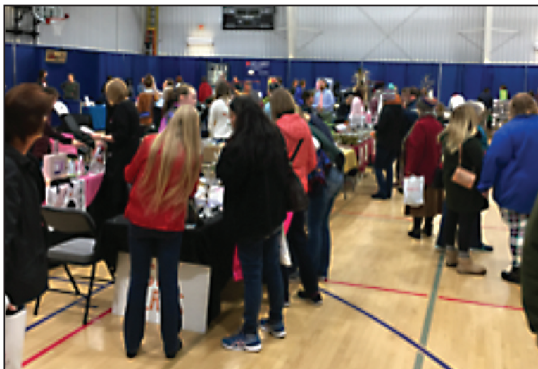
The 9th Annual Garland City Women's Expo was held on Saturday November 2nd.