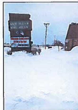
Record amounts of snow pile up in front of Heartland Communications' WRJO/WERL Stations Building in Eagle River.

Schools cancelled classes, most meetings were cancelled and our Heartland cancellation broadcasts went on for over a half an hour or more reporting cancellations of events, games, business closings, church services and many meetings cancellations. Bruce