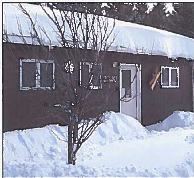
Spilling off the roof in Ashland, Heartland Communications WBSZ/WNXR/WJJH Stations Building is nearly buried in records amount of snow. Where's that groundhog?

But wait... those of you that have been praying for our winter "life blood" snows, please change your snow request prayers to prayers of gratitude. Please. Dear Lord, we've had